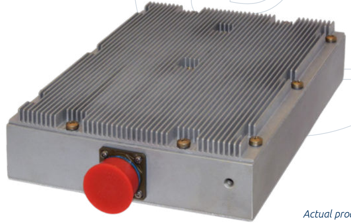
Actual product appearance may vary.