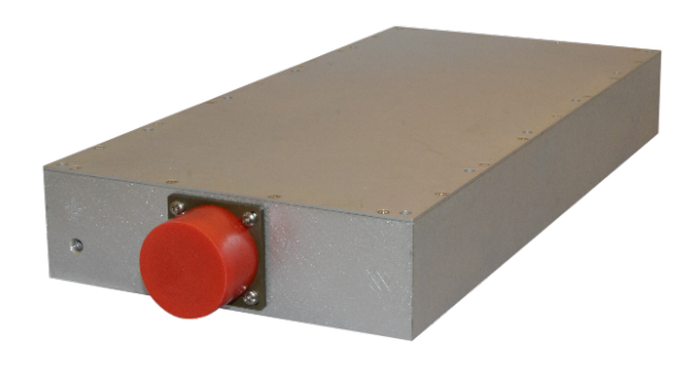
Actual appearance may vary to that shown above.