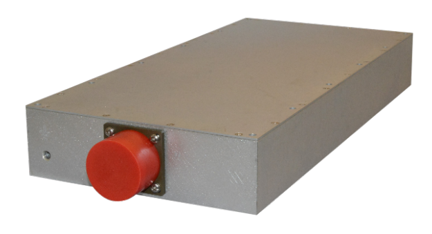
Actual appearance may vary to that shown above.