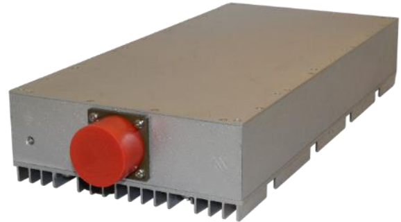
Actual appearance may vary to that shown above.