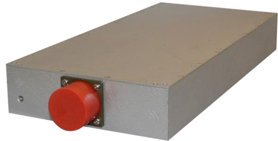
Actual appearance may vary to that shown above.