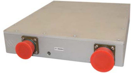
Actual appearance may vary to that shown above.