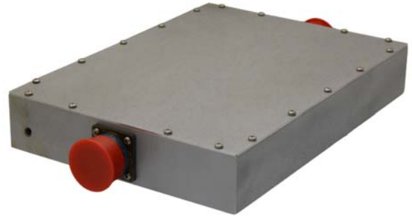
Actual appearance may vary to that shown above.