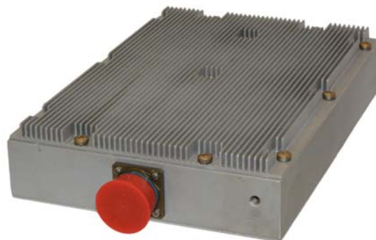
Actual appearance may vary to that shown above.