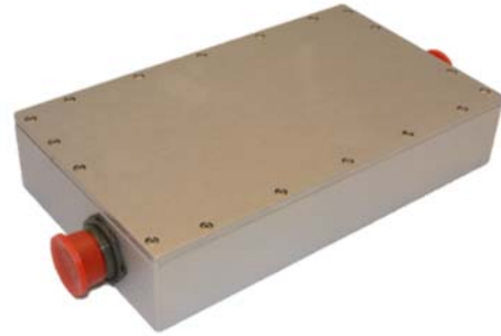
Actual appearance may vary to that shown above.