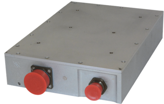
Actual appearance may vary to that shown above.