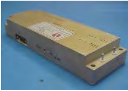
Airborne Dual Laser Driver Power Supply