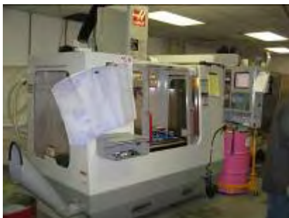
3-axis CNC Machining Center