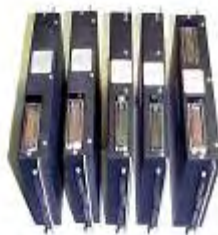
F18 – ATFLIR System Power Supply