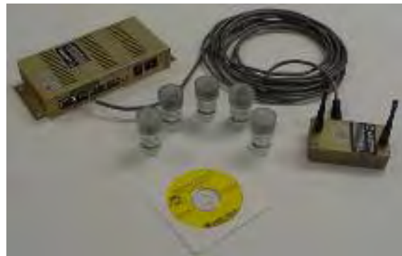
Wireless Vibration Monitoring