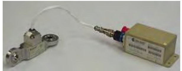
Aerial Refueling Load Cell & Signal Conditioner