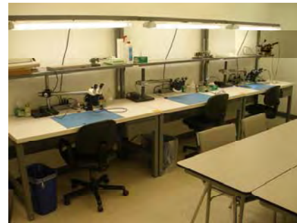
Dedicated Training Room