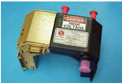
A10 - Heads Down Display

The following pictures provide a very brief look at some of the many products that ACT has designed and produced. From these pictures, you can see that ACT has produced power supplies and sensor products for a wide range of programs and environments.