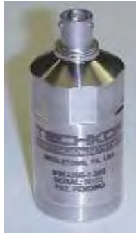
USB Digital Accelerometer