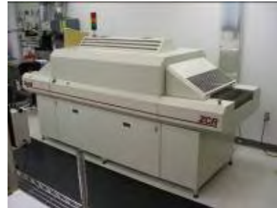
Quad ZCR Reflow Oven