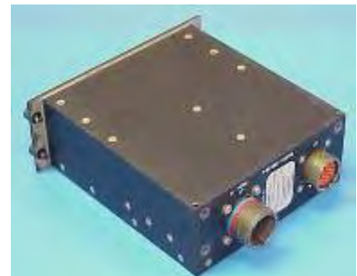
F18 CRT Helmet Display