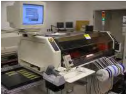
Quad QSV-1 Surface Mount Pick & Place