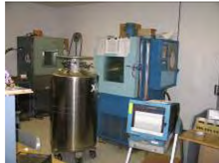
Temperature & Altitude Testing