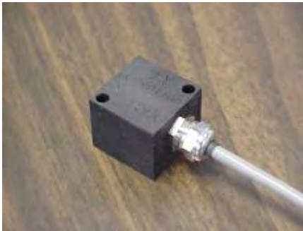
Missile 3-axis Accelerometer