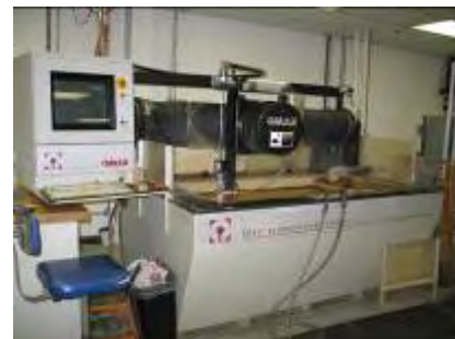
High Speed Water Jet